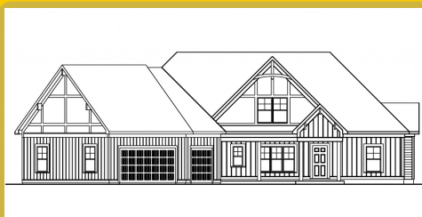
SUTTON A 45

Base Price: $600,000 2,946 sqft 5 Beds 3.5 Baths