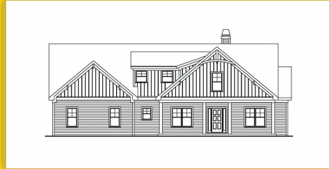
BENSON A XL

Base Price: $668,000 4,204 sqft 4 Beds 4 Baths