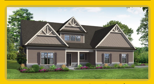
WINFIFI D B