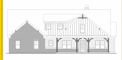
BENSON F XL

Base Price: $589,900 2,977 sqft 4 Beds 3 Baths