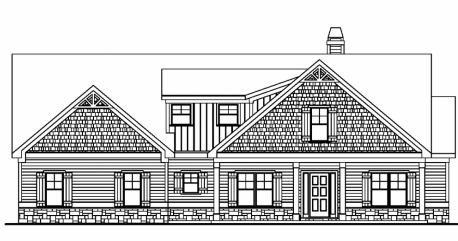
BENSON B XL

Base Price: $685,900 4,204 sqft 4 Beds 4 Baths