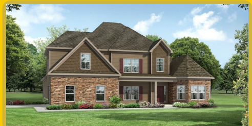
WOODBURY B Base Price: $612,500 3,711 sqft 4 Beds 3.5 Baths

SALES CENTER 438 Fox Hall Crossing West Senoia, GA 30276