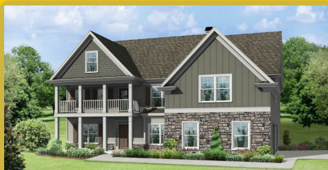
STERLING B Base Price: $698,700 5,291 sqft 5 Beds 5.5 Baths