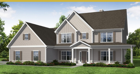
PALMER B Base Price: $573,700 3,079 sqft 4 Beds 3.5 Baths