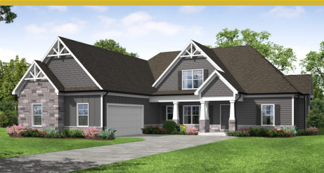
SUTTON C Base Price: $582,500 2,946 sqft 5 Beds 3.5 Baths