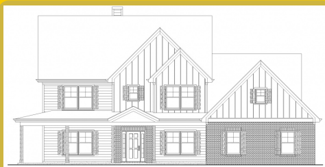
PALMER F Base Price: $644,900 3,223 sqft 4 Beds 3.5 Baths