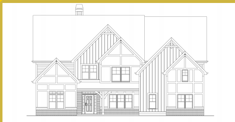
JORDAN F Base Price: $767,700 5 Beds 5.5 Baths