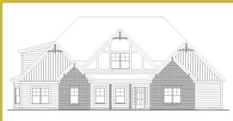
GREYWELL F Base Price: $690,700 3,662 sqft 5 Beds 4 Baths