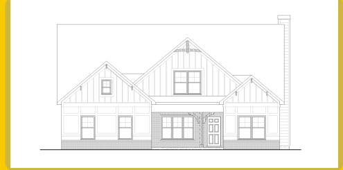
DANSBY F Base Price: $605,700 2,628 sqft 4 Beds 3 Baths