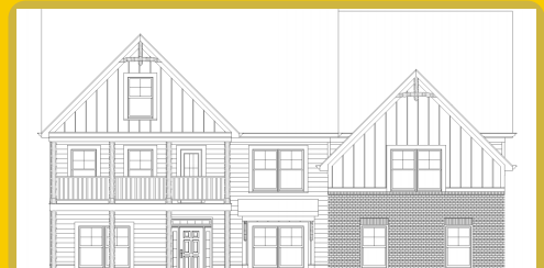
STERLING F Base Price: $775,500 5,291 sqft 5 Beds 5.5 Baths

*Base prices do not reflect options or applicable lot premiums These prices and features are accurate as of 2025-07-03 07:00 and subject to change thereafter.