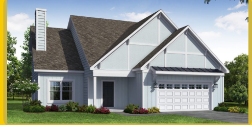
FREEMAN A 5 ...

Base Price: $315,200 2,418 sqft 4 Beds 2.5 Baths