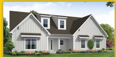
WINFIELD A Base Price: $631,900 3,071 sqft 5 Beds 3.5 Baths

*Base prices do not reflect options or applicable lot premiums These prices and features are accurate as of 2024-04-09 17:57 and subject to change thereafter.