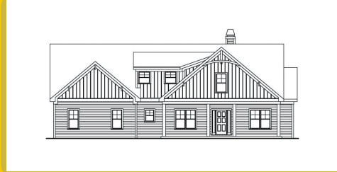
BENSON A XL Base Price: $623,900 2,977 sqft 4 Beds 3 Baths