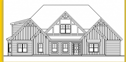
GREYWELL A Base Price: $686,500 3,662 sqft 5 Beds 4 Baths