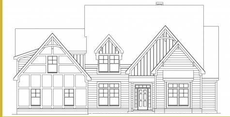
BELMONT A Base Price: $711,500 4,204 sqft 4 Beds 4 Baths