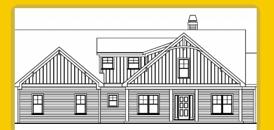
BENSON A XL