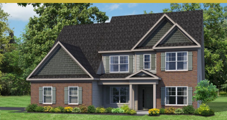
STANTON B Base Price: $525,900 2,639 sqft 4 Beds 3.5 Baths