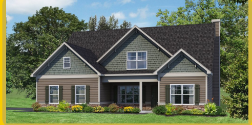
DANSBY B Base Price: $531,700 2,633 sqft 4 Beds 3 Baths