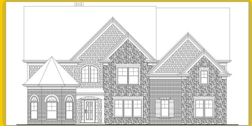
JORDAN Base Price: $681,700 5,331 sqft 5 Beds 5.5 Baths