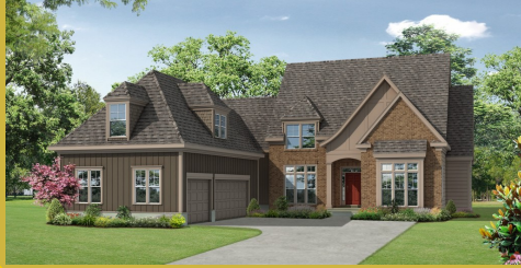
BELMONT B Base Price: $640,900 4,155 sqft 4 Beds 4 Baths