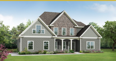
MURPHY B Base Price: $574,700 3,692 sqft 5 Beds 3.5 Baths