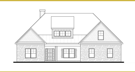
HARRIS B Base Price: $542,900 2,814 sqft 4 Beds 3 Baths