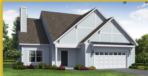
FREEMAN A 5 BE..

Base Price: $459,400 2,418 sqft 4 Beds 2.5 Baths