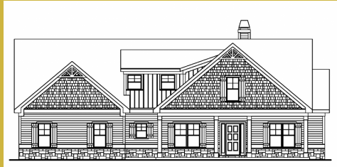
BENSON B XL

Base Price: $515,800 2,977 sqft 4 Beds 3 Baths