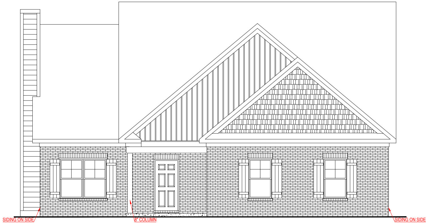
FRONT ELEVATION - D VERSION