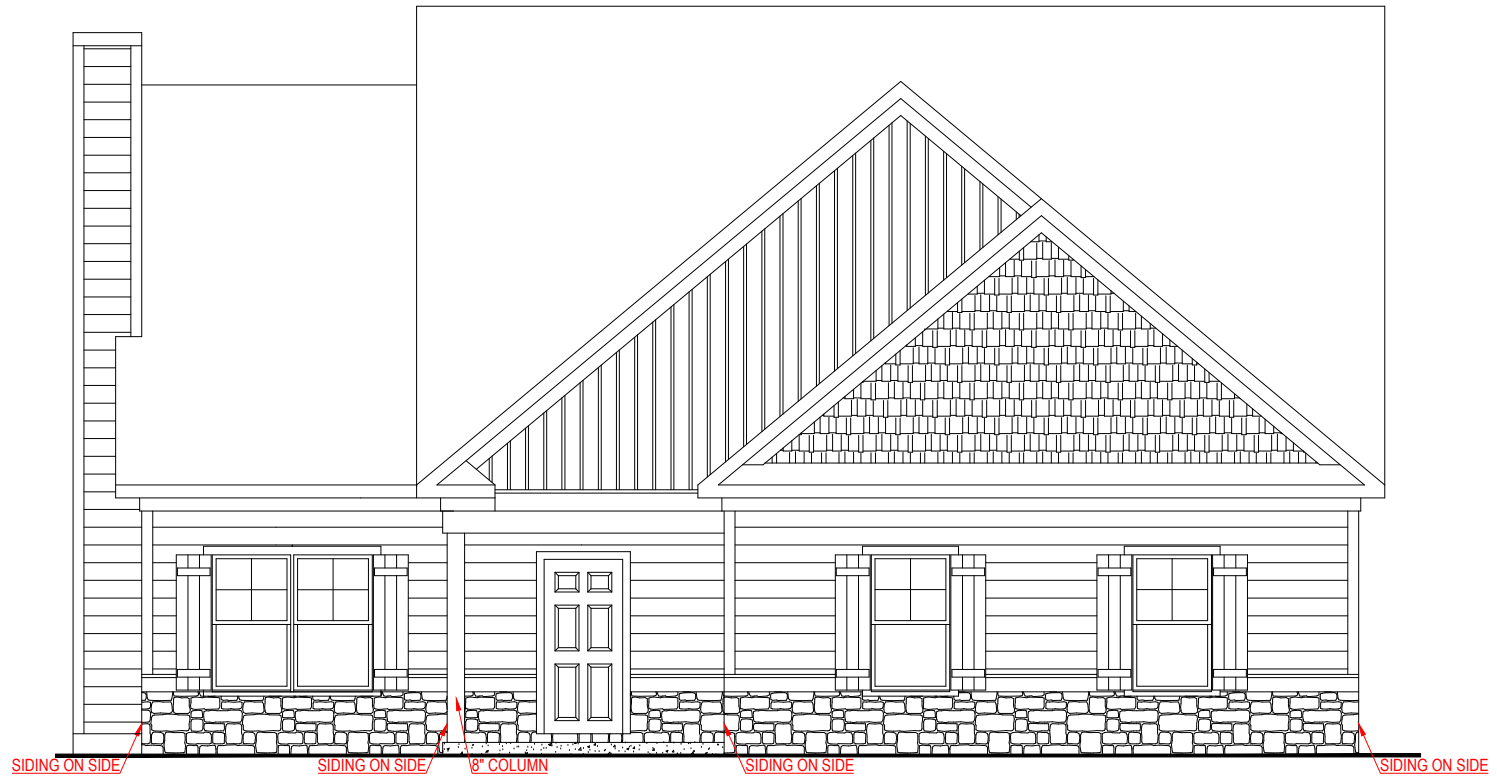
FRONT ELEVATION - B VERSION