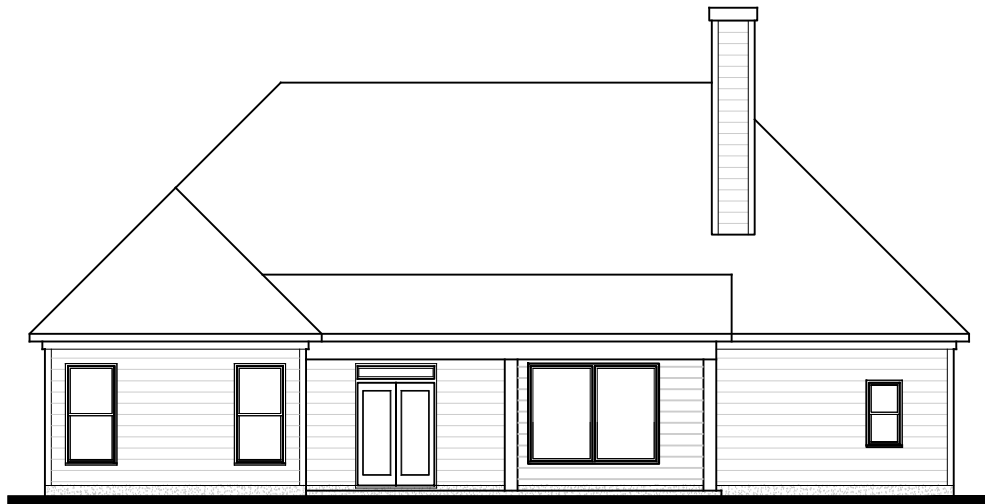
REAR ELEVATION- EXPANDED PATIO OPTION