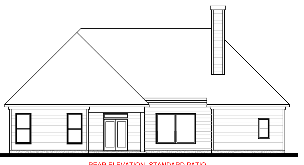
REAR ELEVATION- STANDARD PATIO