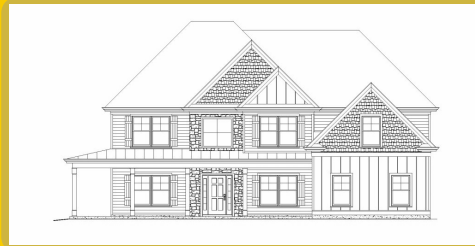
MILLWOOD B Base Price: $845,900 3,454 sqft 5 Beds 4 Baths