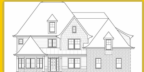
JACKSON B Base Price: $986,700 5,252 sqft 5 Beds 5.5 Baths