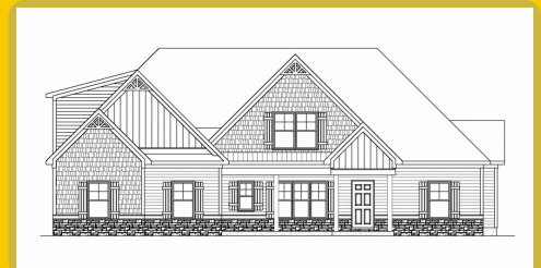
SUTTON B Base Price: $832,500 2,938 sqft 5 Beds 3.5 Baths

*Base prices do not reflect options or applicable lot premiums These prices and features are accurate as of 2026-04-03 07:00 and subject to change thereafter.