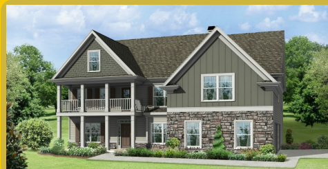
STERLING B Base Price: $982,500 5,291 sqft 5 Beds 5.5 Baths