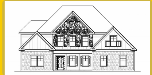
MURPHY B Base Price: $855,700 3,687 sqft 5 Beds 3.5 Baths