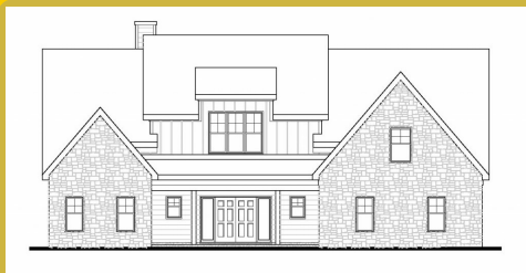
HARPER B Base Price: $897,800 3,832 sqft 5 Beds 4 Baths