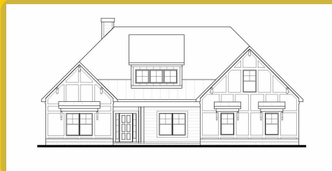
HARRIS A Base Price: $568,700 2,948 sqft 4 Beds 3 Baths