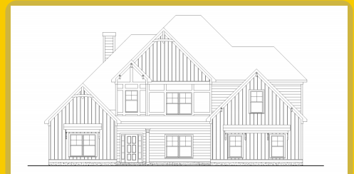
WOODBURY A Base Price: $614,500 3,702 sqft 4 Beds 3.5 Baths

SALES CENTER GA-16 & Belle Hall Dr Newnan, GA 30263