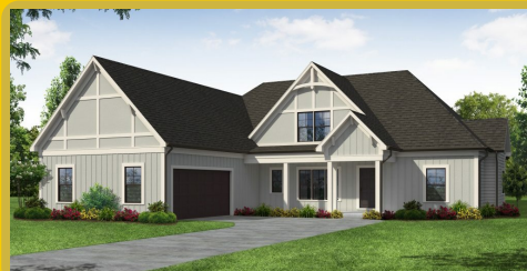
SUTTON A Base Price: $586,700 2,946 sqft 5 Beds 3.5 Baths