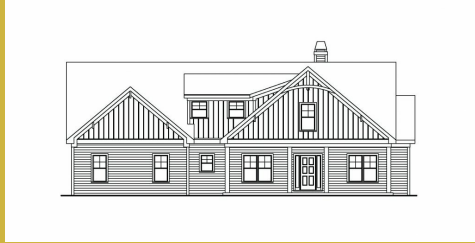
BENSON A XL

Base Price: $567,500 2,977 sqft 4 Beds 3 Baths