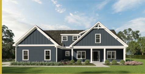
BENSON A XL

Base Price: $582,500 2,977 sqft 4 Beds 3 Baths