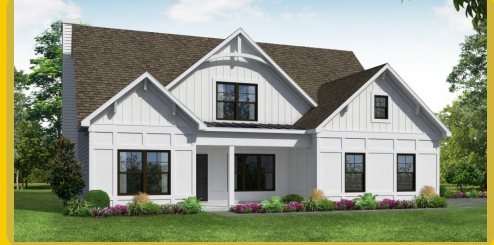
DANSBY A Base Price: $562,500 2,628 sqft 4 Beds 3 Baths