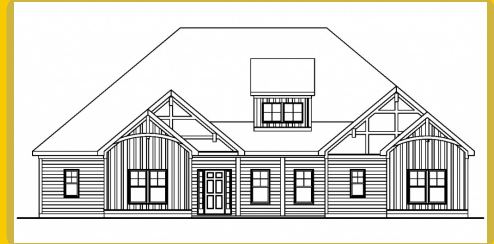
SPRINGER A Base Price: $575,700 2,765 sqft 4 Beds 3 Baths