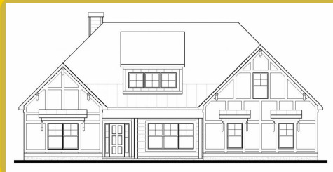
HARRIS A Base Price: $583,700 2,948 sqft 4 Beds 3 Baths