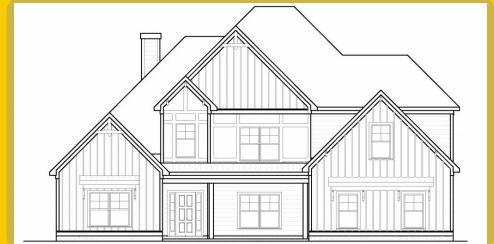
WOODBURY A Base Price: $629,500 3,702 sqft 4 Beds 3.5 Baths

SALES CENTER 43 Belle Hall Drive Newnan, GA 30263