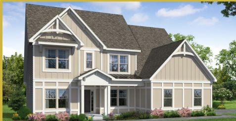
STANTON A Base Price: $563,700 2,533 sqft 4 Beds 3.5 Baths