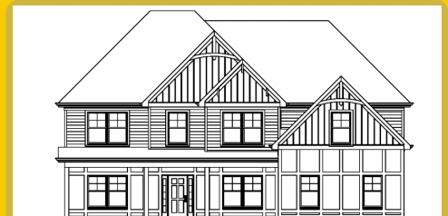
MILLWOOD A Base Price: $608,900 3,463 sqft 5 Beds 4 Baths