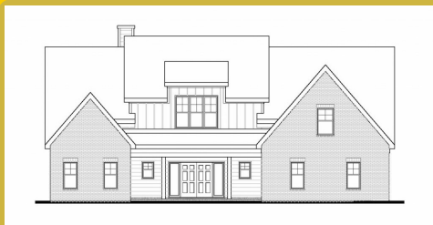
HARPER F Base Price: $1,004,400 3,832 sqft 5 Beds 4 Baths