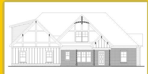
SUTTON F Base Price: $942,700 2,946 sqft 5 Beds 3.5 Baths

*Base prices do not reflect options or applicable lot premiums These prices and features are accurate as of 2026-04-09 07:00 and subject to change thereafter.