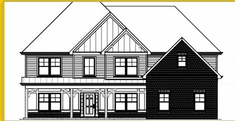
MILLWOOD F Base Price: $955,700 3,463 sqft 5 Beds 4 Baths