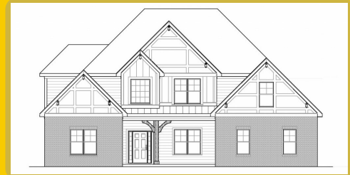
MURPHY F Base Price: $965,700 3,695 sqft 5 Beds 3.5 Baths