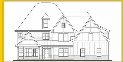
JACKSON F Base Price: $1,095,500 5,259 sqft 5 Beds 5.5 Baths