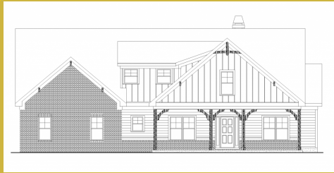
BENSON F XL

Base Price: $622,900 2,977 sqft 4 Beds 3 Baths