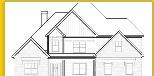
WOODBURY F Base Price: $665,500 3,702 sqft 4 Beds 3.5 Baths

SALES CENTER 774-606 Jim Starr Road Newnan, GA 30263