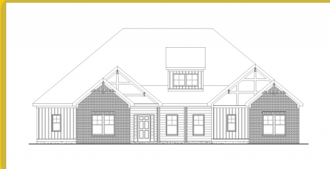
SPRINGER F Base Price: $615,700 2,765 sqft 4 Beds 3 Baths