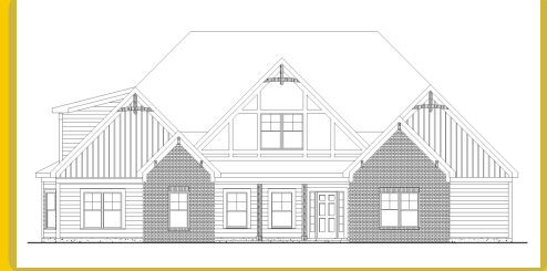
GREYWELL F Base Price: $677,700 3,662 sqft 5 Beds 4 Baths