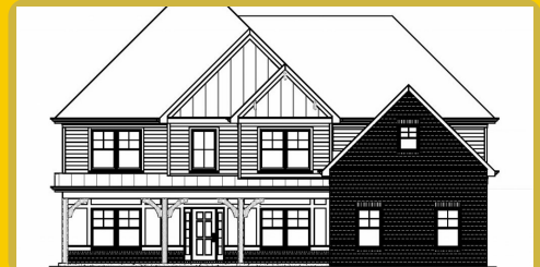
MILLWOOD F Base Price: $643,700 3,463 sqft 5 Beds 4 Baths