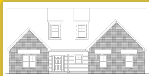
WINFIELD F Base Price: $630,900 3,071 sqft 5 Beds 3.5 Baths