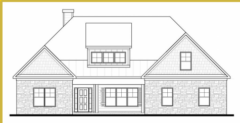
HARRIS B Base Price: $645,900 2,948 sqft 4 Beds 3 Baths