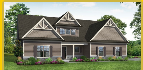
WINFIELD B Base Price: $649,500 3,071 sqft 5 Beds 3.5 Baths