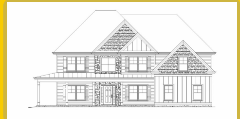
MILLWOOD B Base Price: $666,500 3,454 sqft 5 Beds 4 Baths