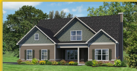
DANSBY B Base Price: $611,900 2,633 sqft 4 Beds 3 Baths