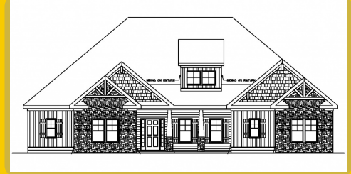
BRANTLEY B Base Price: $620,700 2,660 sqft 4 Beds 3 Baths