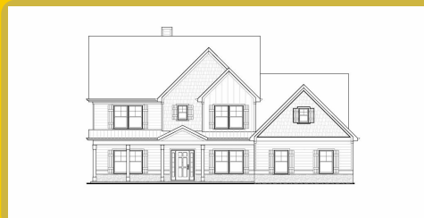
TURNER B Base Price: $654,700 3,079 sqft 4 Beds 3.5 Baths