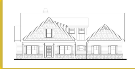
BELLINGER B Base Price: $630,900 2,807 sqft 4 Beds 3 Baths