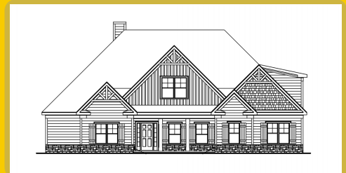
GORDON B Base Price: $684,700 3,507 sqft 5 Beds 4 Baths