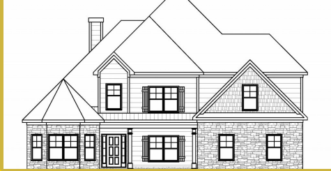
ANDERSON B Base Price: $682,500 3,496 sqft 4 Beds 3.5 Baths