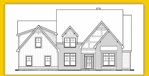
BRYANT B 90

Base Price: $595,900 2,977 sqft 4 Beds 3 Baths