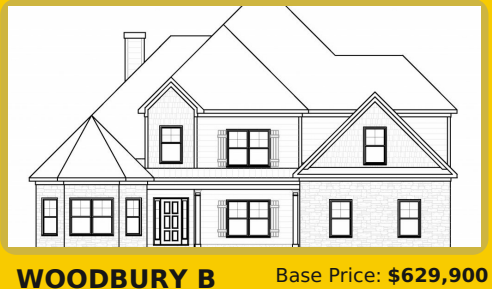
3,711 sqft 4 Beds 3.5 Baths

SALES CENTER 438 Fox Hall Crossing West Senoia, GA 30276