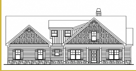
BENSON B XL

Base Price: $610,900 2,977 sqft 4 Beds 3 Baths