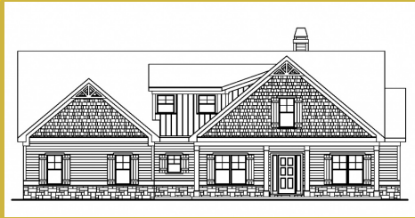
BENSON B XL

Base Price: $615,900 2,977 sqft 4 Beds 3 Baths