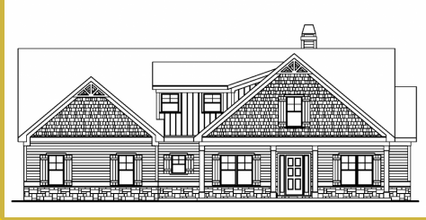
BENSON B XL

Base Price: $615,900 2,977 sqft 4 Beds 3 Baths