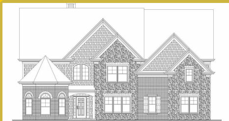
JORDAN Base Price: $764,500 5,331 sqft 5 Beds 5.5 Baths