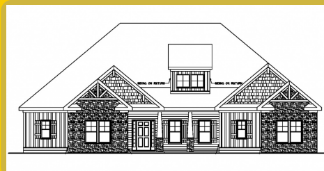
SPRINGER B Base Price: $605,500 2,765 sqft 4 Beds 3 Baths