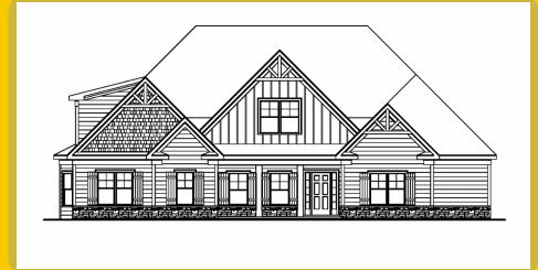
GREYWELL B Base Price: $683,500 3,662 sqft 5 Beds 4 Baths