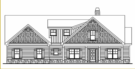
BENSON B XL Base Price: $620,900 2,977 sqft 4 Beds 3 Baths