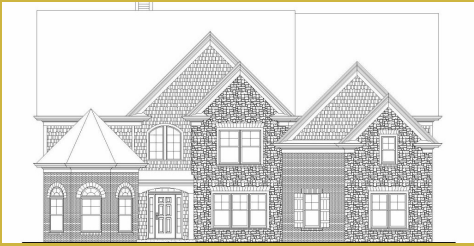
JORDAN Base Price: $774,500 5,331 sqft 5 Beds 5.5 Baths