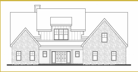
HARPER B Base Price: $702,800 3,832 sqft 5 Beds 4 Baths