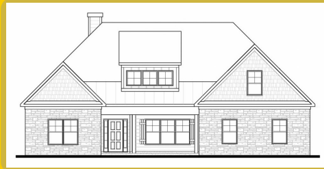
HARRIS B Base Price: $623,900 2,948 sqft 4 Beds 3 Baths