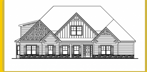
GREYWELL B Base Price: $693,500 3,662 sqft 5 Beds 4 Baths