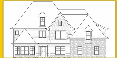
JACKSON B Base Price: $784,700 5,252 sqft 5 Beds 5.5 Baths