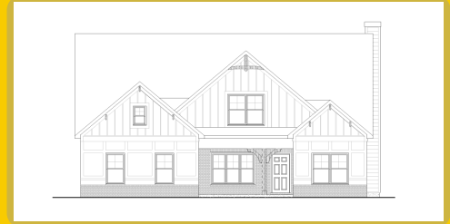
DANSBY F Base Price: $605,700 2,628 sqft 4 Beds 3 Baths