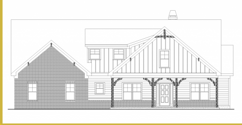
BENSON F XL

Base Price: $626,900 2,977 sqft 4 Beds 3 Baths