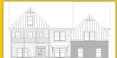
STERLING F Base Price: $785,500 5,291 sqft 5 Beds 5.5 Baths

*Base prices do not reflect options or applicable lot premiums These prices and features are accurate as of 2026-04-09 07:00 and subject to change thereafter.