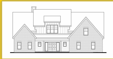
HARPER F Base Price: $707,800 3,832 sqft 5 Beds 4 Baths