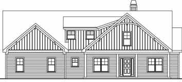
BENSON A XL

Base Price: $651,900 2,977 sqft 4 Beds 3 Baths