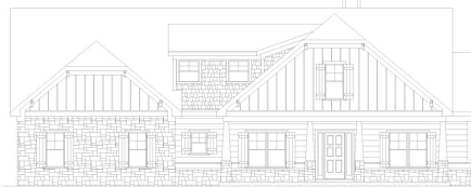
BENSON C XL

Base Price: $651,900 2,977 sqft 4 Beds 3 Baths