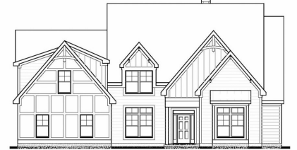
BRYANT A 90

Base Price: $724,900 3,635 sqft 4 Beds 4 Baths