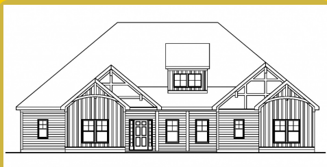
SPRINGER A Base Price: $647,700 2,765 sqft 4 Beds 3 Baths