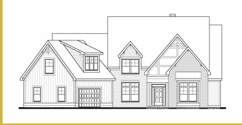
BRYANT B 30

Base Price: $779,900 3,635 sqft 4 Beds 4 Baths