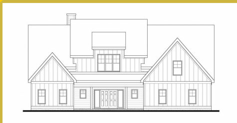
HARPER A Base Price: $785,700 3,832 sqft 5 Beds 4 Baths