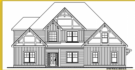
MURPHY A Base Price: $744,700 3,695 sqft 5 Beds 3.5 Baths