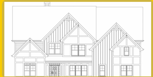
JORDAN A Base Price: $867,500 5 Beds 5.5 Baths