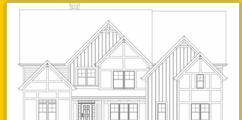
JORDAN A Base Price: $867,500 5 Beds 5.5 Baths