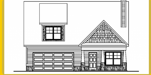
KERSHAW B Base Price: $498,700 2,512 sqft 4 Beds 3.5 Baths