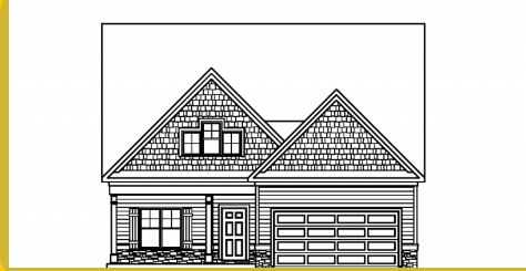
DAWSON B Base Price: $493,500 2,441 sqft 4 Beds 3 Baths