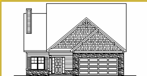
KIMBREL B Base Price: $493,500 2,376 sqft 4 Beds 3.5 Baths