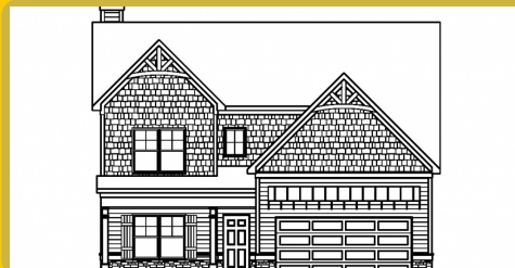
MANTLE B Base Price: $515,500 2,524 sqft 4 Beds 3 Baths