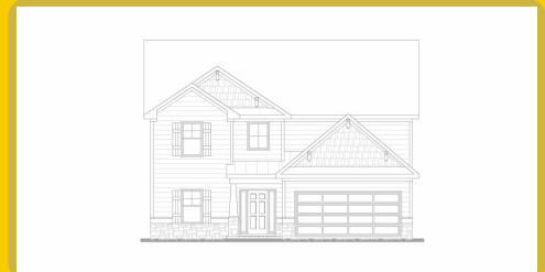
OLSON B Base Price: $497,900 2,575 sqft 4 Beds 3.5 Baths