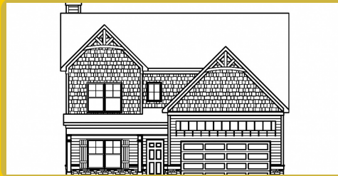
MANTLE B Base Price: $515,500 2,524 sqft 4 Beds 3 Baths