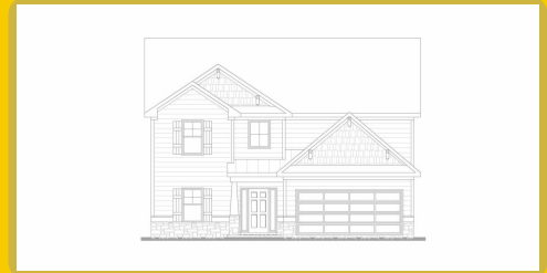
OLSON B Base Price: $497,900 2,575 sqft 4 Beds 3.5 Baths