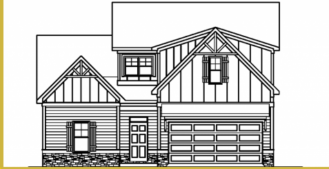
CARLTON B Base Price: $507,900 2,565 sqft 4 Beds 3.5 Baths