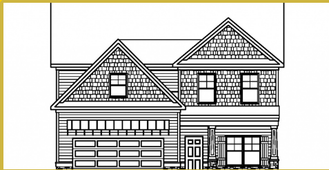
TAYLOR B Base Price: $539,900 2,900 sqft 4 Beds 3 Baths

SALES CENTER Leverett Drive Newnan, GA 30265