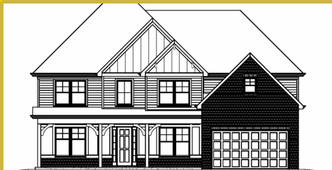
MILLWOOD F Base Price: $991,700 3,458 sqft 5 Beds 4 Baths