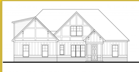
CARAY F Base Price: $969,700 2,796 sqft 5 Beds 3.5 Baths