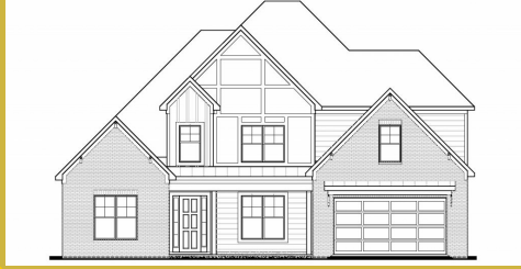
ANDERSON F Base Price: $999,900 3,505 sqft 4 Beds 3.5 Baths