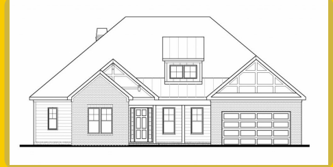
BRANTLEY F Base Price: $965,700 2,660 sqft 4 Beds 3 Baths