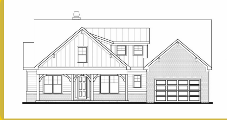
BELLINGER F Base Price: $968,500 2,807 sqft 4 Beds 3 Baths